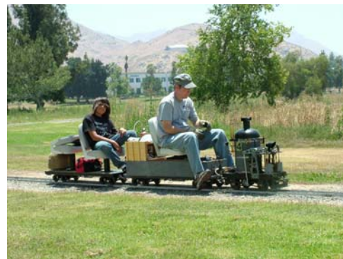
An un-named little engine that could

There were a large number of engines on the track; ranging in size from a vertical boiler little thing to a full grown Santa Fe Northern" 4-8-4 #2926.