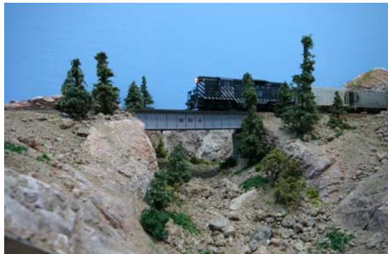
RDA girder Xing the dry gulch