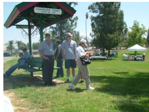
Panorama Point was a popular waiting spot