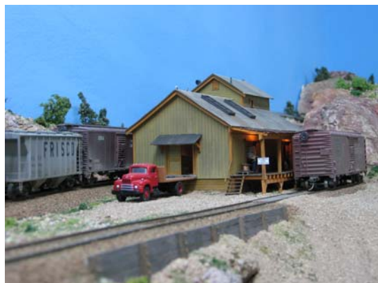
Freight Station awaits loading crew

meets and also started doing clinics, all of which were top notch and always drew a