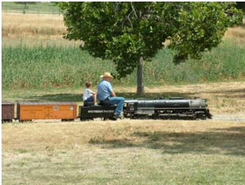
SP Northern #828