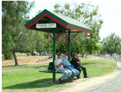
Panorama Point was a popular waiting spot