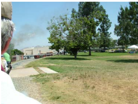
Cajon members enjoying the ride

At 11AM, sharp, the first "All Aboard" call was heard and a large group of members climbed onboard one of the trains; a double-header just for the Cajon members' enjoyment.