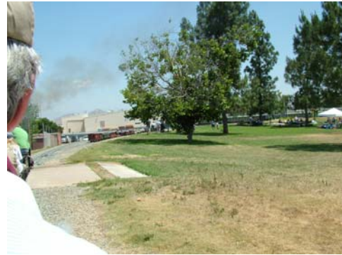
Cajon members enjoying the ride

The ride turned out to be a really long one, one car kept derailing and uncoupling from the rest of the train. It is not just us HO people that seem to have problem with our cars!